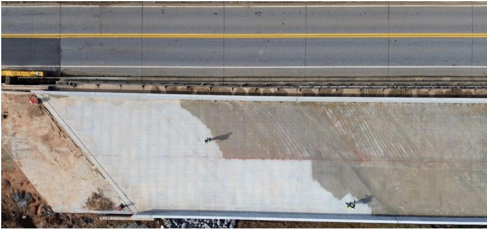
PROJECT NAME: GA DOT BRIDGE