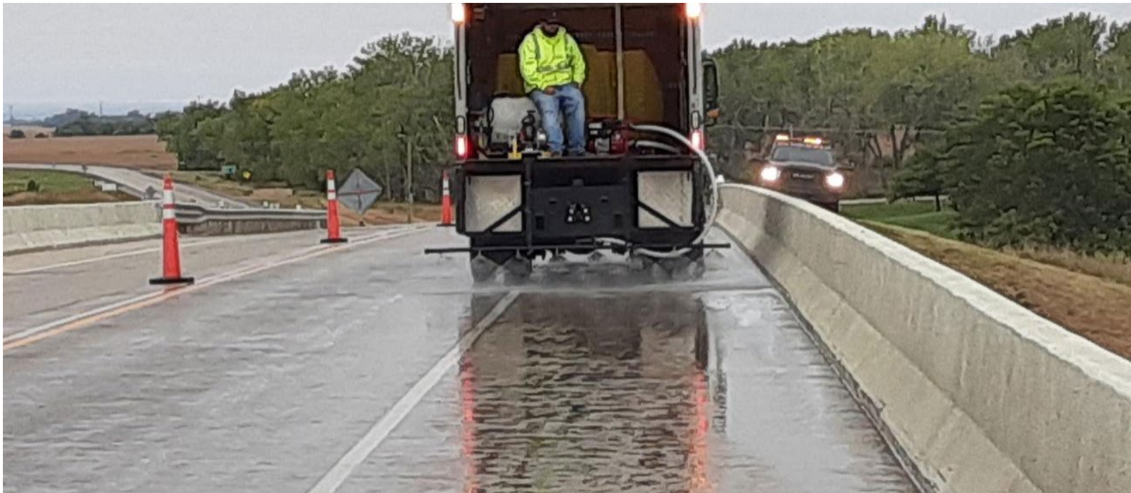
PROJECT NAME: SOUTH DAKOTA DOT

LOCATION: OUTSIDE MILLBANK, SOUTH DAKOTA, USA