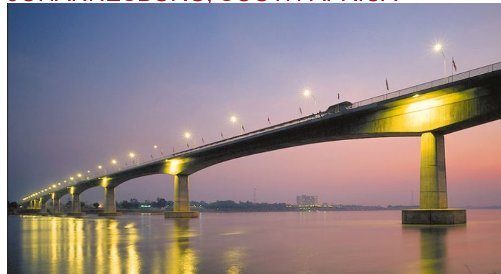
HIGHWAY BRIDGE – CONNECTING LAOS & THAILAND