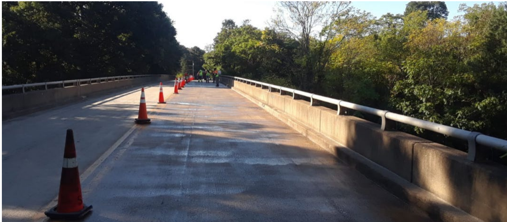
PROJECT NAME: HOWELL MILL BRIDGE