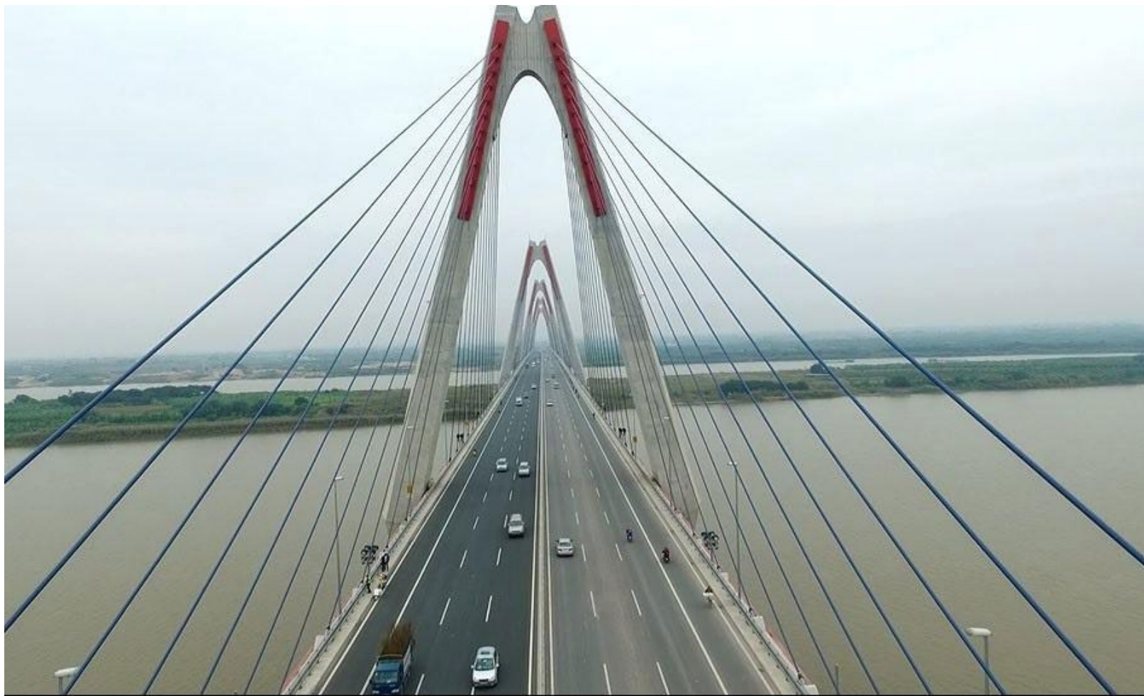
NHAT TAN BRIDGE – HANOI, VIETNAM

1 MILLION+ SQUARE FOOT CONCRETE BRIDGE DECK (8 LANES WIDE) AS IT WAS CONSTRUCTED IN 2013-2014