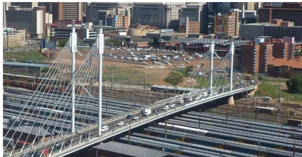
NELSON MANDELA BRIDGE JOHANNESBURG, SOUTH AFRICA