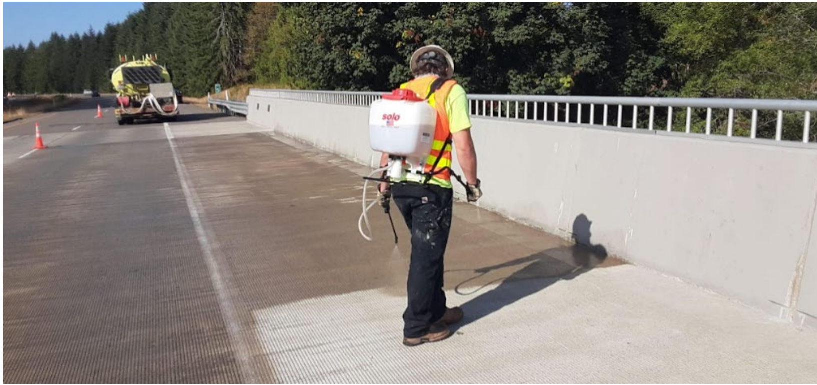
PROJECT NAME: WASHINGTON STATE DOT