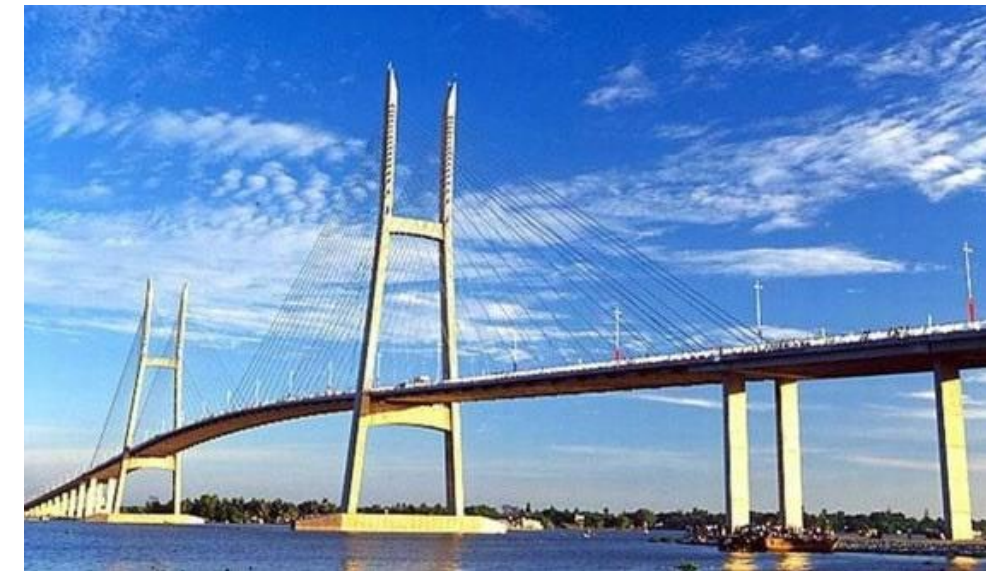
MY THUAN BRIDGE – VINH LONG CITY, VIETNAM