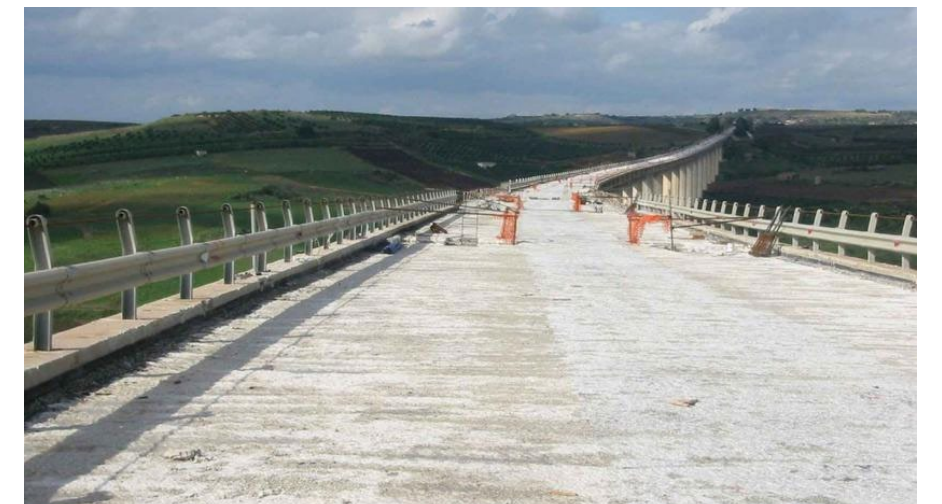
HIGHWAY SS 115 BRIDGE- ITALY