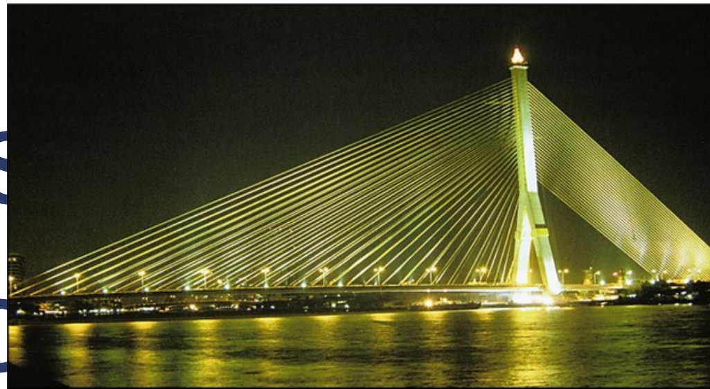
RAMA VIII BRIDGE- BANGKOK, THAILAND