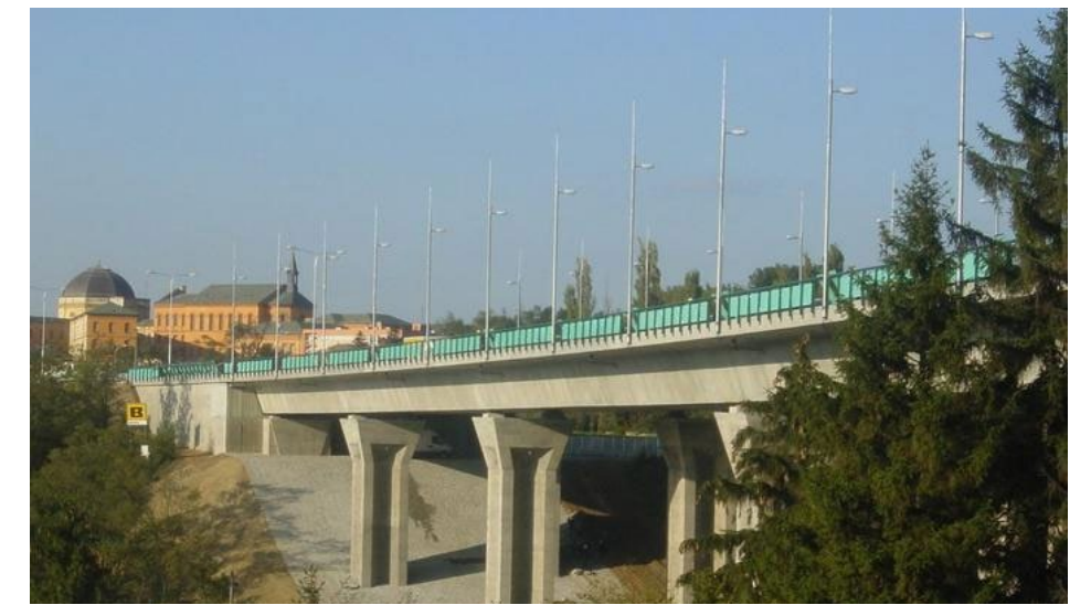
TYRSUV SAD OVERPASS – CZECH REPUBLIC