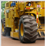
Crush and Shape