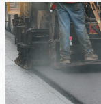
Mill and Overlay