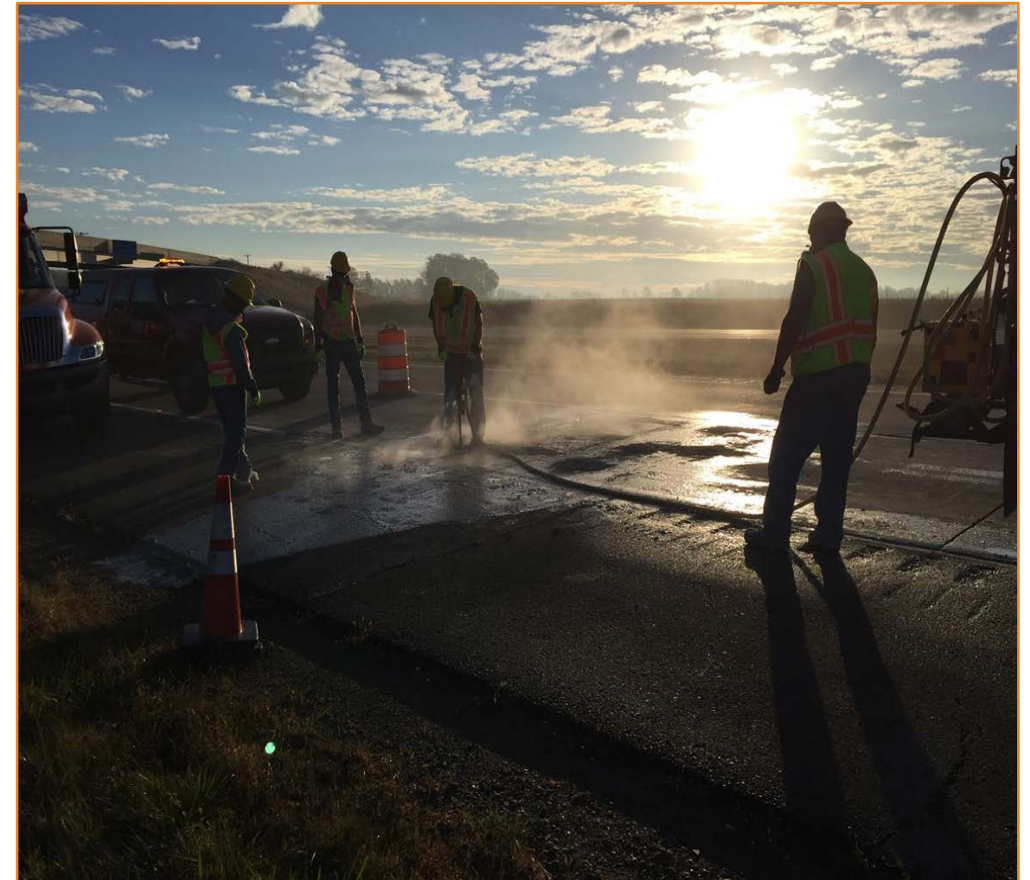
MDOT maintenance crew drilling pin holes on I-69